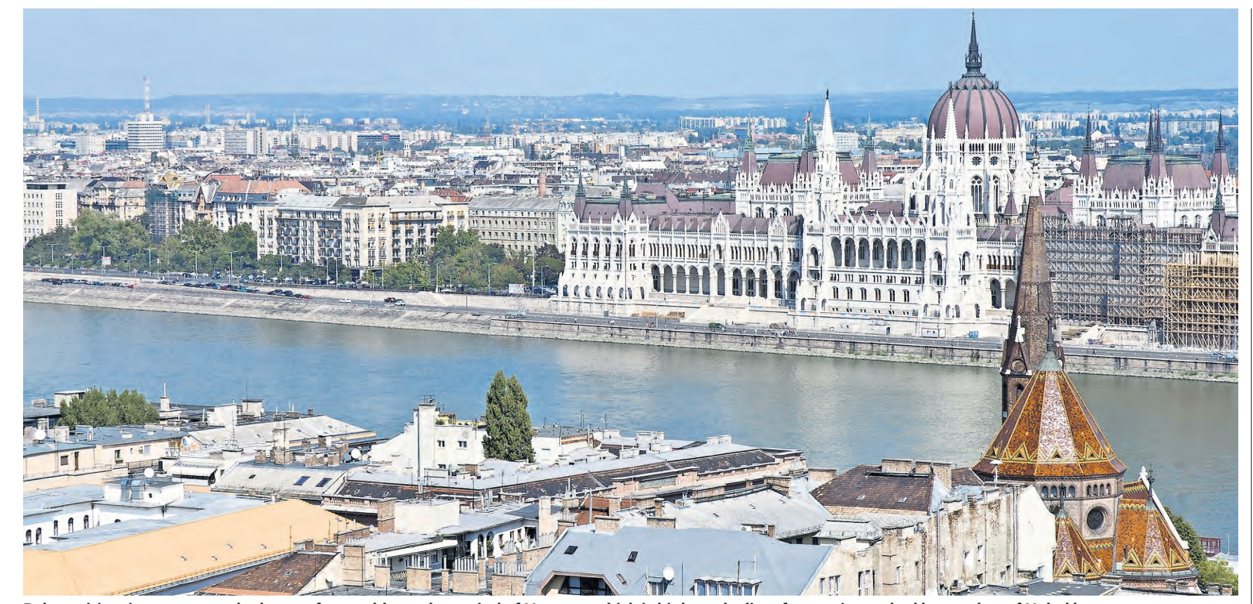
Pole position: investors now look more favourably on the capital of Hungary which is high on the list of countries ranked by number of Nobel laureates