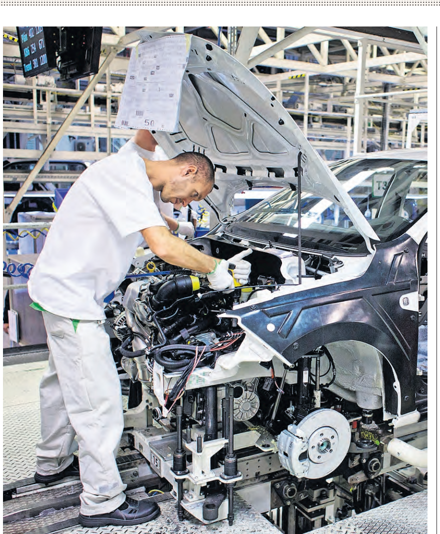
Economic miracles: a Skoda plant in the Czech Republic. In 2000, Volkswagen bought out the company and has transformed its methods and output

EU membership for 11 ex-communist countries since 2004 gave full access to a single European market numbering