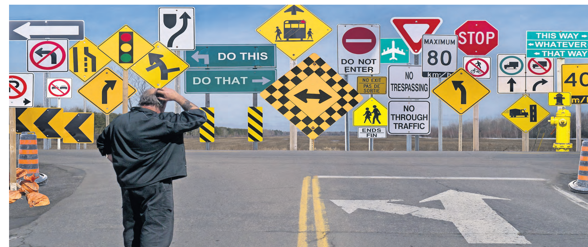
Guidance needed