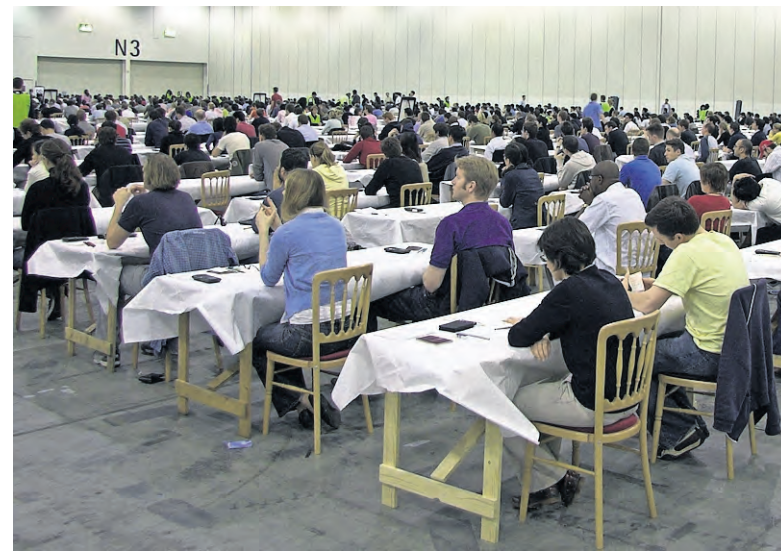
Knowledge is power

The survey is part of the board's advocacy work to address the so-called "feminine famine" in financial planning and sway the demographics of CFP holders. The board estimates there are 53,845 male and 16,215 female CFP holders – just 23 per cent of planners certified. That