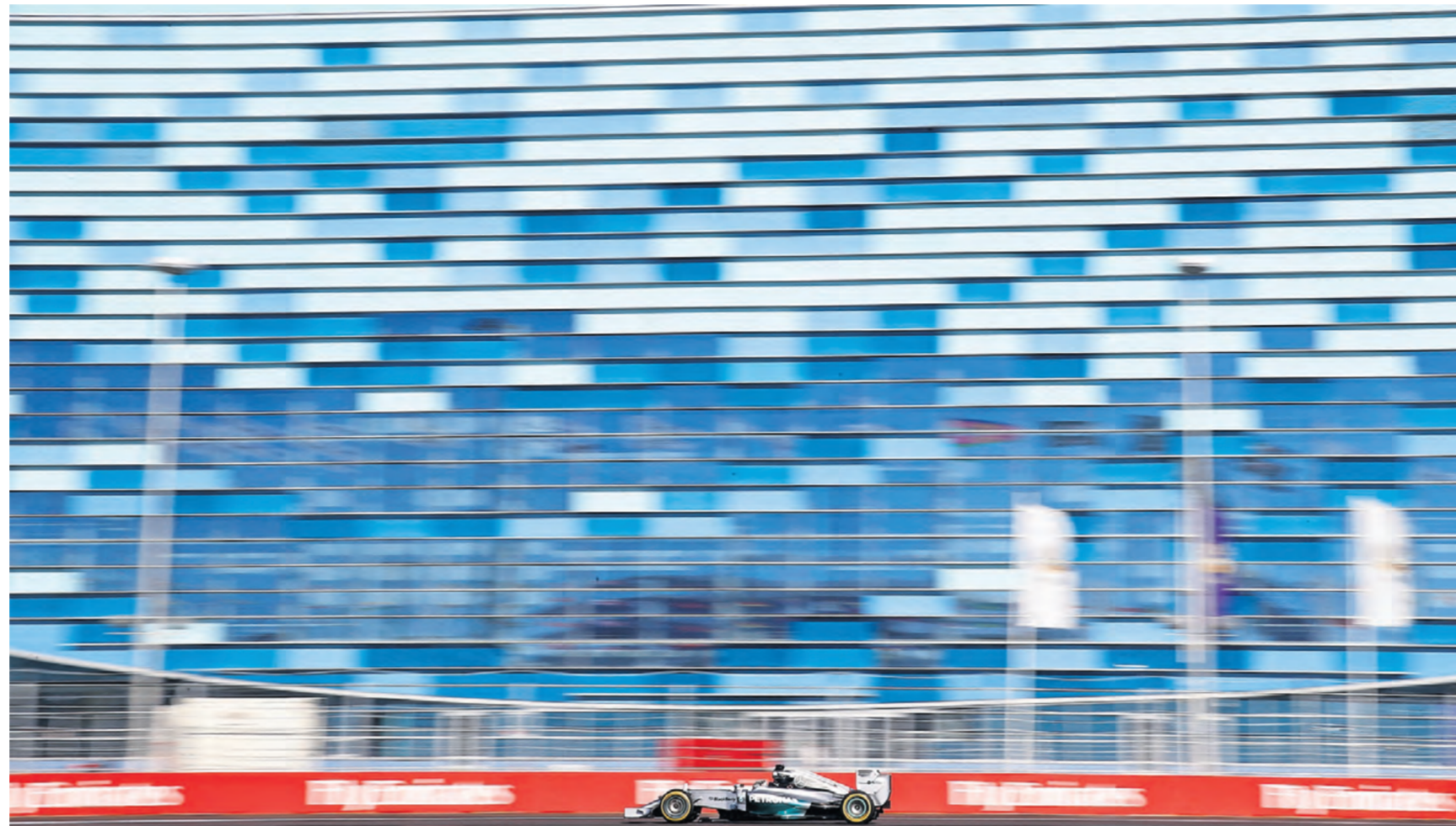
One team: Mercedes has dominated the season, with Lewis Hamilton (above) and Nico Rosberg duelling for the drivers' championship.

ing point - the on-track rivalry of drivers whose win-at-all-costs desire and willingness to take risk at the edge of the rule book has no comparison in sport.