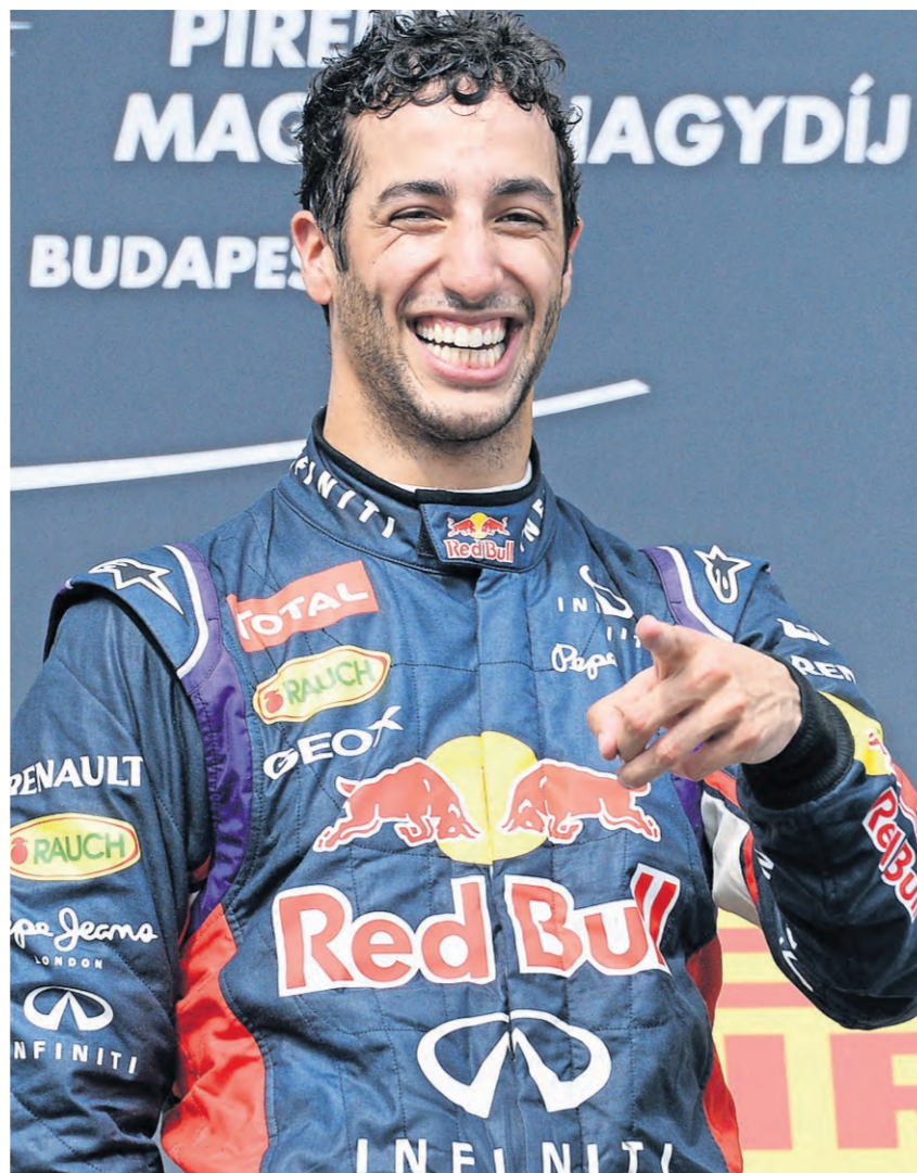
Winning smile: Daniel Ricciardo has had three wins this season

“In F1 circles, there are sometimes political things you have to be careful about but in general I'm not briefed beyond ‘You may get asked this ques-