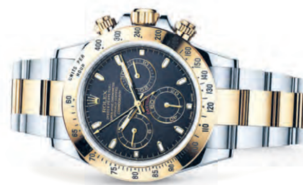
OYSTER PERPETUAL COSMOGRAPH DAYTONA

BRAKING 5 METRES LATER: 0.221 SECONDS SAVED. IT'S ALL ABOUT TIME.