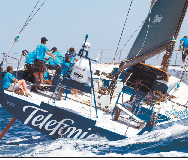
Risk management: the ocean race relies on commercial financial support

The unromantic reality of the yachting industry, particularly for superyachts of more than 30m or 100 feet in length, is that the majority of those produced, bought and used are dieselrather than sailing boats.