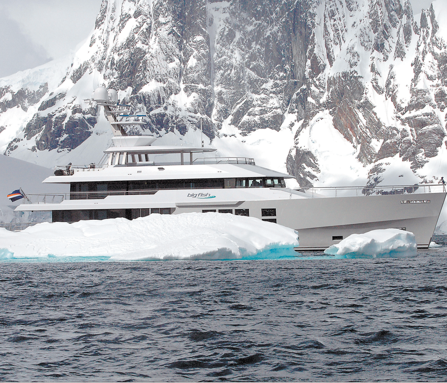
New breed of boat: the 45m motoryacht Big Fish is designed for long trips and has completed a voyage to the Antarctic Peninsula

Then there is the 141m Dream Symphony, being made (of wood) in Turkey, reportedly for a Ukrainian buyer, and which But those headline figures will be the largest luxury mask an intriguing detail. While sailing yacht in history.