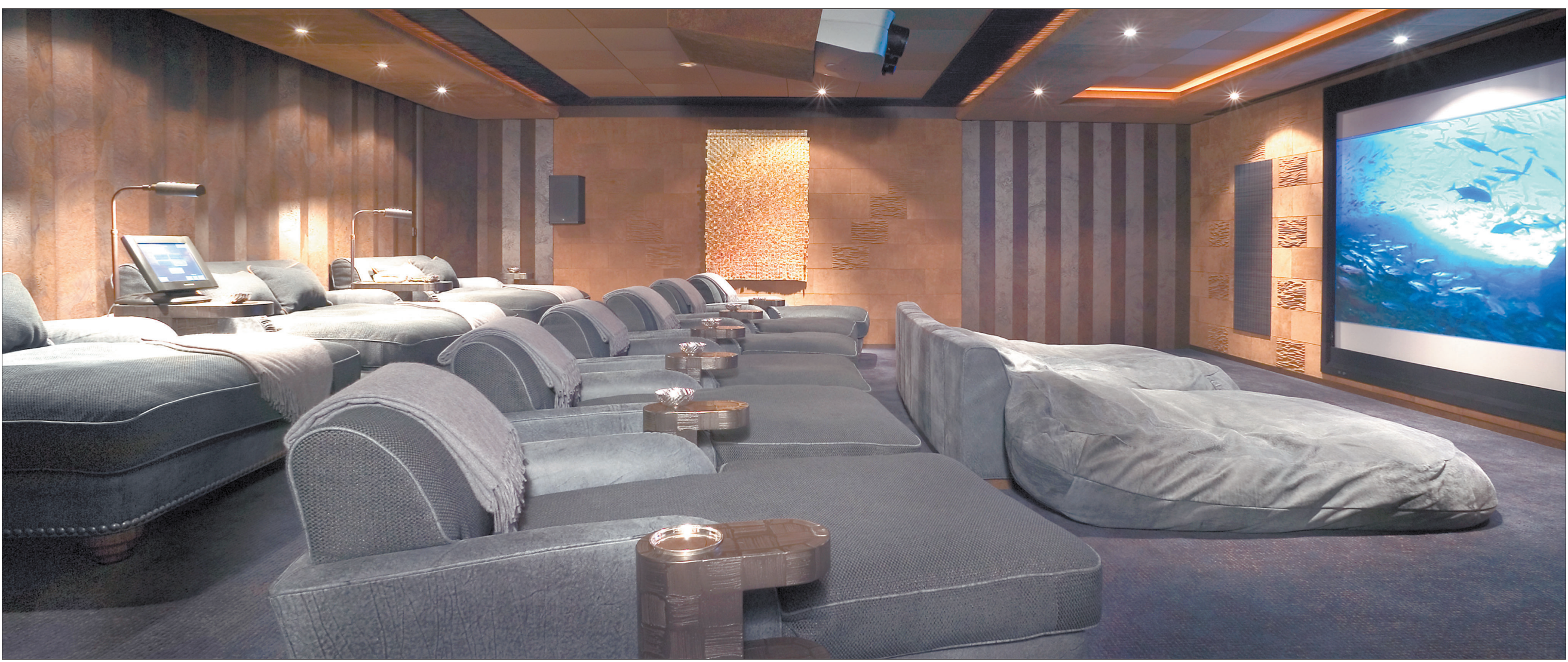
The scene is set: the cinema on board Pelorus, the 115m motoryacht owned by Roman Abramovich